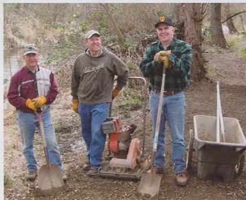
Our skilled crew leaders create a rewarding and positive learning environment at each workday.